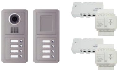
DOOR ENTRY KITS