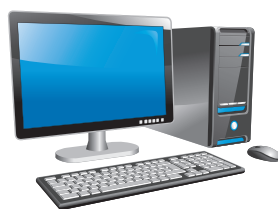
PC BASED PROXIMITY